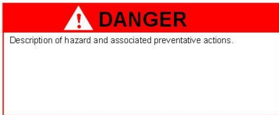
Figure 1: Sample Danger Notice

B.8.2 Consultant shall provide warning notices throughout each of the Operations & Maintenance Manuals where there is a hazard that can cause serious personal injury, death, or major property damage.